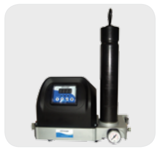
Cartridge Lube Pump

The CLP Cartridge Pump is a robust electrically driven single outlet lubrication pump, designed primarily for use with progressive divider valve systems. The pump is capable of utilizing most standard off the shelf industry grease cartridges, including DIN1284, Lube Shuttle and Fuchs. The CLP is available with 12 and 24 VDC motors, making it suitable for both mobile and standard industrial applications. An integral controller is available, or the unit can be configured to be controlled by an external controller.